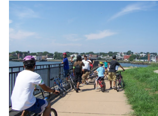
Youth on a Bike Tour

Youth Crew: This Youth Leadership Program focuses on environmental resiliency projects in East Boston. The youth are in charge of resident polling and other studies, managing a local community garden, giving educational workshops, organizing community events and neighborhood clean-ups, and more.