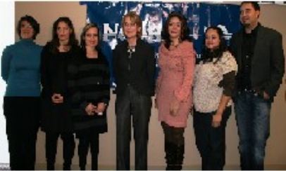
Past Attorney General Martha Coakley with NOAH Counselors

Foreclosure Prevention: NOAH counselors provide free bilingual education and counseling to clients on how to avoid foreclosure in over 95 communities in Greater Boston/the North Shore.