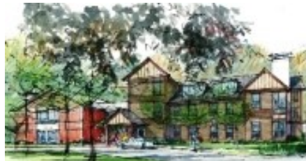
Benfield Farms, Carlisle

Each year, NOAH serves more than 1,700 low/mod. income clients, often people with diverse cultures and languages; over 60% of clients represent an ethnic minority.