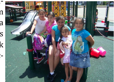
O'Donnell Schoolyard Program

Children's Summer Programs: Each summer, NOAH organizes a 7-week bilingual summer recreational and educational program for children at a local Schoolyard as well as a 9-week bilingual youth soccer program.